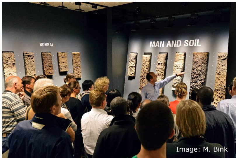
Figure 6: Guided group in the World Soil Museum.

The core of the visitor groups is academic: mainly students and researchers from higher education centers and universities. Links have been established with other programs of Wageningen University, such as the Science Lab for kids (children's University 5 ) and with geography teachers through the Royal Dutch Geographical Society (KNAG). The increase in number of visitors and broadening of user groups has generated more exposure for ISRIC and for Wageningen University and Research (Mantel, 2017).