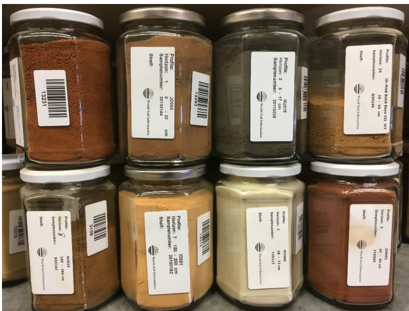
Figure 4: Barcoded pots with sieved and grinded reference soil samples.

Examples of the use of samples from the reference collection (see Figure 4 for an example of storage of the samples) are: 1) calibration of spectral analytical equipment for rapid, non-destructive and low-cost analysis of various soil attributes such as particle-size distribution, organic carbon and nutrients (ICRAF, Kenya 4 ); 2) soil carbon related studies by researchers at Wageningen University for; 3) development of detergents by Unilever (UK); 4) improvement of estimation of clay content from water content for soils rich in smectite and kaolinite (Arthur et al., 2019); 5) assessment of marine influences on shore soils by the Netherlands Institute for Research of the Sea (NIOZ); 6) pre- and post-Chernobyl soil conditions in the Middle East by ICARDA (Syria).