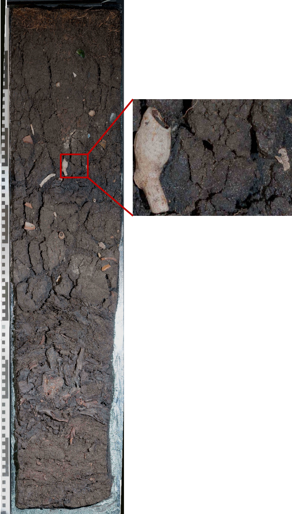
Figure 8: HR image of a Technosol with example of zoomed in detail of profile.

then photographed section by section. These images are digitally 'glued' together into one high resolution image.