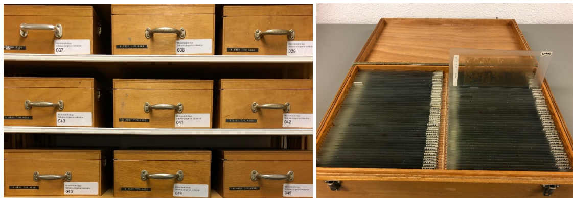
Figure 11: Storage of thin sections of soil.

Current procedure: All monoliths are labelled with a unique code that consists of a two digit ISO country code and a follow-number for the object from the given country. A RDF (Radio-frequency identification) chip is inserted in each monolith board for identification with a PDA (personal digital assistant) device. The monoliths are stored in a large cabinet and the location of each monolith is recorded in a database with respect to the number of the cabinet and its position. Other objects associated with the reference soil profiles, such as thin sections (see Figure 11), have unique sample numbers that refer to the corresponding reference profiles.