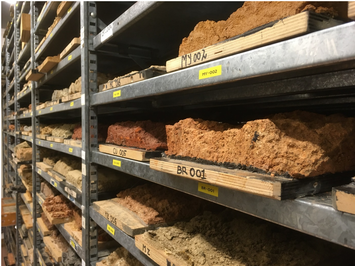
Figure 1: Store for the soil monoliths.