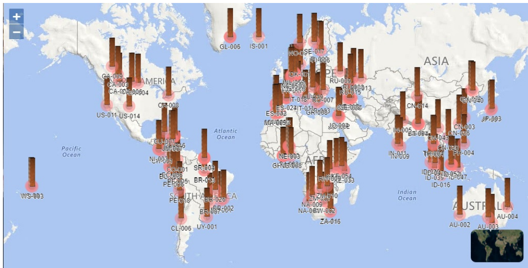
Figure 10: Virtual soil museum (2): online access to soil monolith collection.