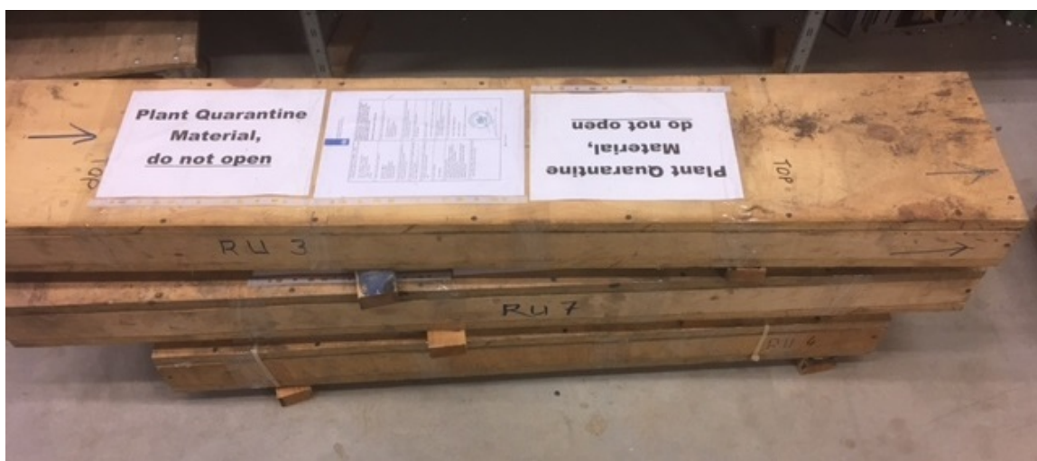
Figure 12: Newly arrived soil profiles in boxes.

The first criterion for adding new soils to the collection will be 'gaps in taxonomic classes' in the reference collection. Other criteria are soils from specific biomes and soils that have changed by human action. Soils underrepresented in the reference collection are, broadly speaking, soils from desert areas, soils from mountains, soils from polar regions and organic soils. Man-made soils and soils that have been changed significantly by human activities are especially relevant for future collection.