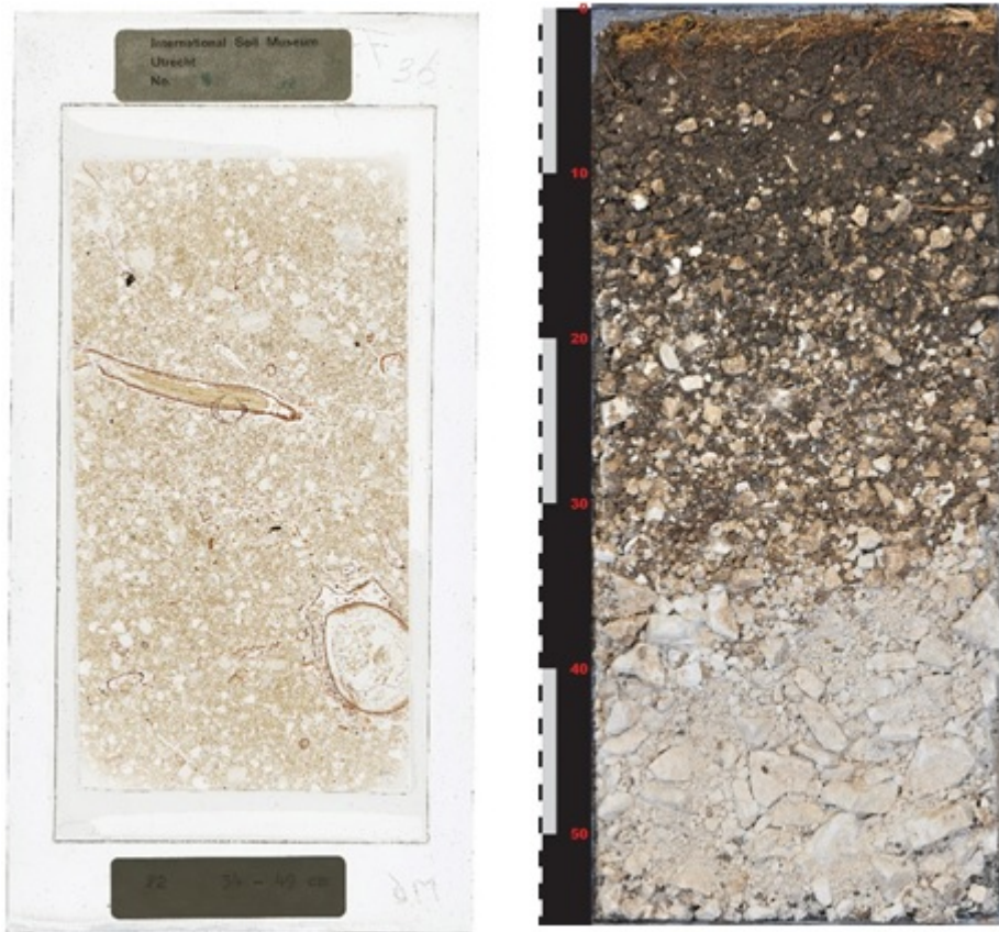
Figure 3: Scan of thin section from a section of a soil from France (l) and a HR image of a soil monolith (r) from the United Kingdom.

ISRIC has established procedures for making reproductions of the collections. These are scans of maps, reports and thin sections (Figures 3 and 11) and digital high-resolution images of soil monoliths (Figures 3 and 8).