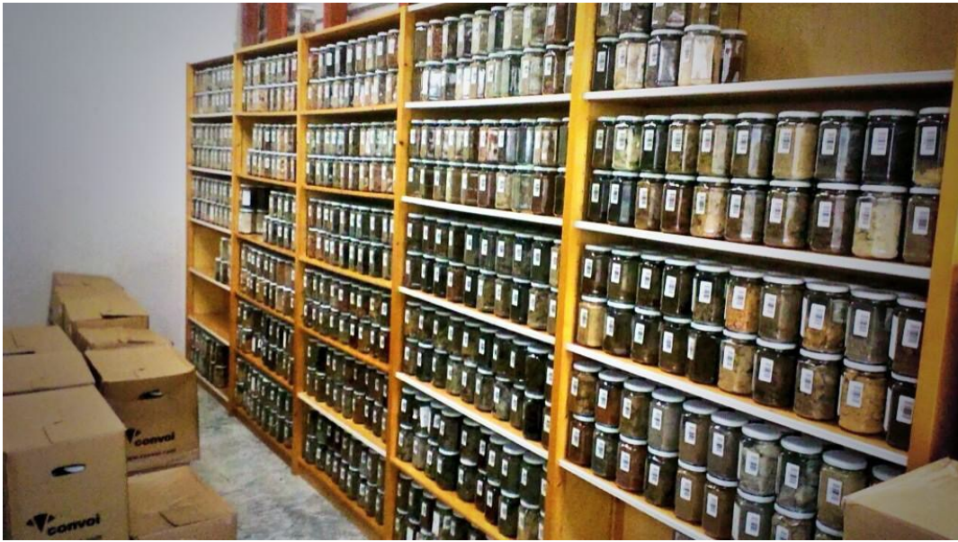
Figure 2: Storage of samples for repair of damaged monoliths.