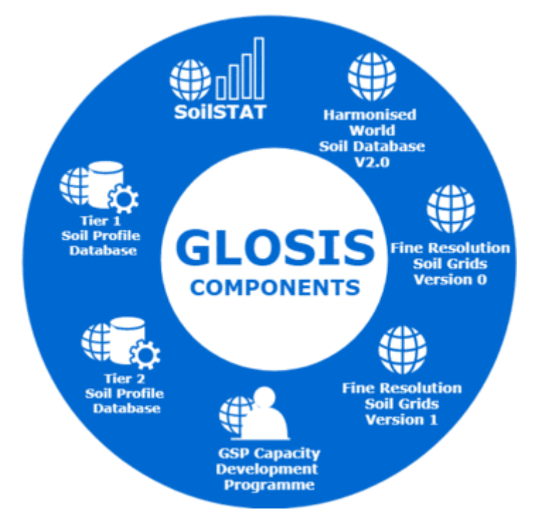
Figure 1. Schematic representation of GLOSIS (Global Soil Information System)

The main purpose of GLOSIS is to enable exchange of consistent, standardised soil data within and between countries, thus facilitating their potential use due enhanced accessibility. The latter in accordance with the licences specified by the original data providers (GSP and FAO 2017b). Within such a federated system there is no single central database. Rather, a central discovery hub will provide a) a registry of national nodes (soil information systems, SIS) that are compliant with GLOSIS exchange standards , and b) provide a search engine through which users may query the standardised data shared by the various national GLOSIS nodes.