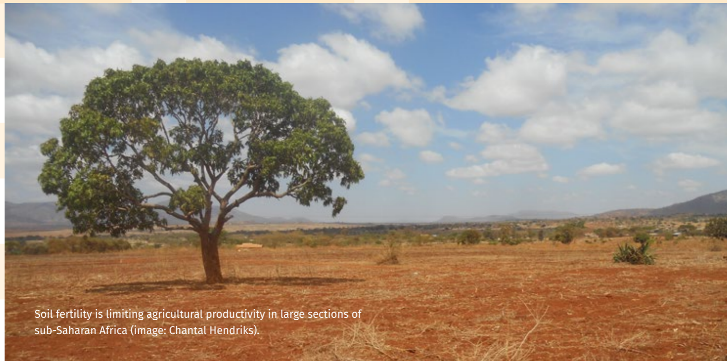
Soil fertility is limiting agricultural productivity in large sections of sub-Saharan Africa.

PARTNERS : AfricaRice, ICRAF, Institut National de Pédologie du Sénégal; Office du Niger (Mali); Société d'Exploitation et d'Aménagement des terres du Delta et des vallées du fleuve Sénégal (Senegal).