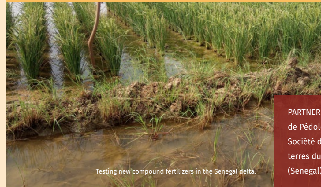
Testing new compound fertilizers in the Senegal delta.

of the Wageningen Environmental Research and the European Commission's Joint Research Centre. The crop yield forecasting system is a key tool for the European Commission to implement the EU's Common Agricultural Policy, which requires information on crop production of the current growing season. The project began in 1988 and this updated soil data will improve future forecasting.